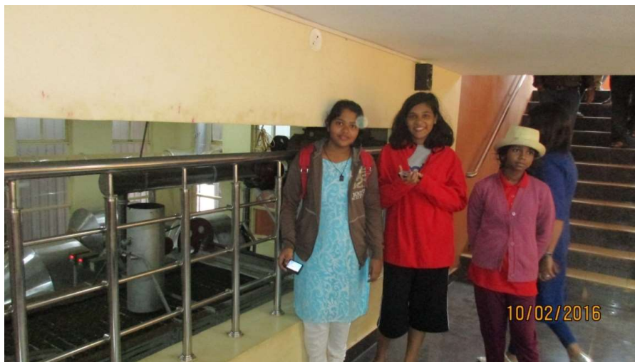
Nature Camp at Kuruva island Wynad