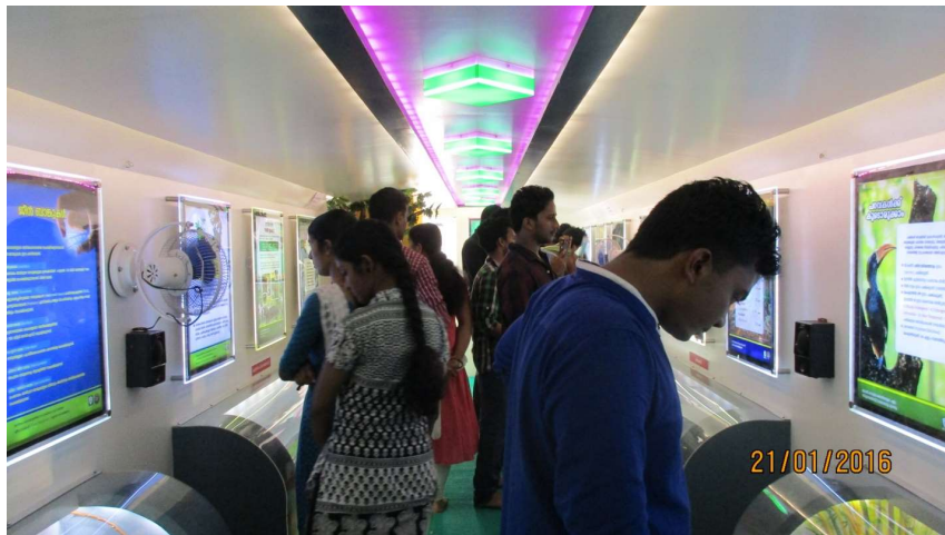
Diversity of Rice variety at Science Exhibition, Dept of Botany.