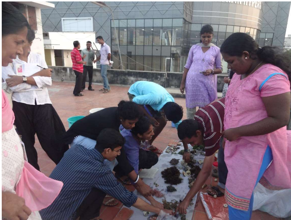
Visit to Soil Museum and Soil Analytical Laboratory. Trivandrum.