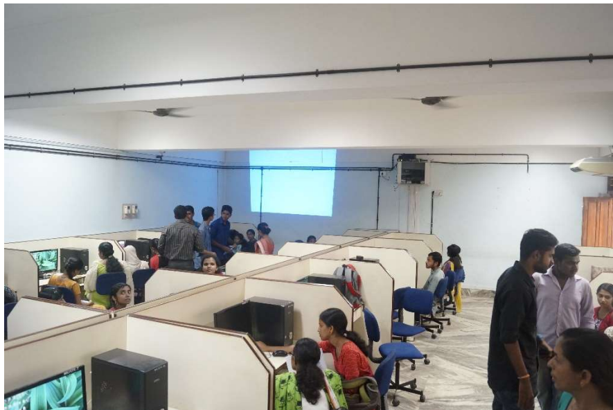
Participants of Bioinformatics training.